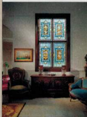
Left: The Steeles altered this antique double-hung stain glass window to fit into their home.