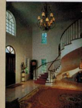
Left: The entrance evokes a Southern mansion with its spiral staircase, marble floors, and chandelier. Center: Meticulous gardens encircle the residence.

One of the greatest undertakings was designing and installing the freestanding, S-shaped front staircase. "The staircase came in a truck," Ray says. "It weighed 2,500 pounds and took 25 guys to squirrel