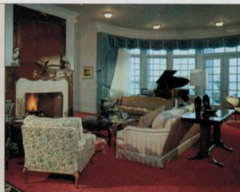
Center: Almost every room offers expansive views.