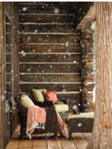
LONE CHIEF PARADISE RANCH