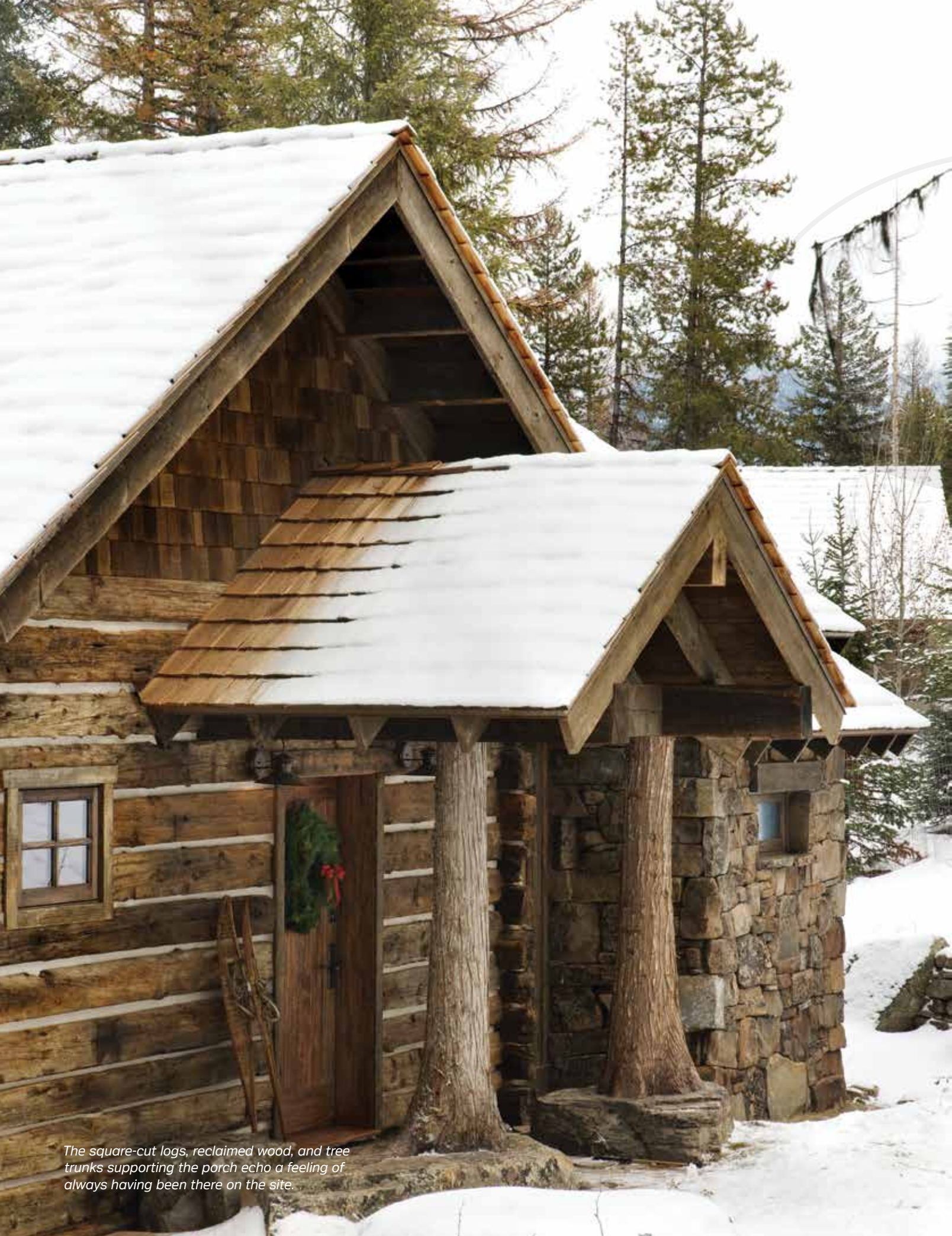
The square-cut logs, reclaimed wood, and tree trunks supporting the porch echo a feeling of always having been there on the site.