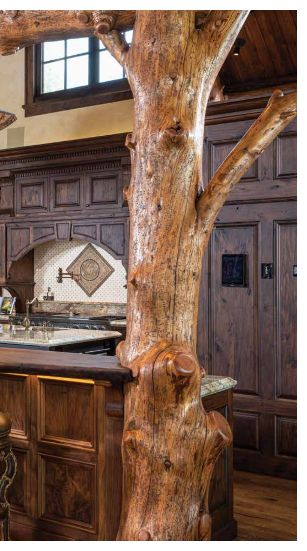
With its multiple prep spaces and double island with bar stool seating, the free-flowing kitchen offers enough elbowroom for multiple cooks or those simply wanting to join in the conversation.

without help from the jaw-dropping character logs that frame the mountain vistas and crown the space.