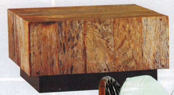
Coffee Table Leblon Coffee Table in peroba and mahogany, High Fashion Home, highfashionhome.com for pricing