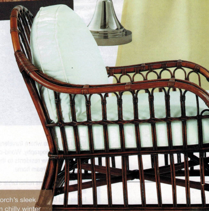
Armchair Madeira Chair with Ottoman in Rustic Brown rattan, $579; Ballard Designs, ballarddesigns.com

WARMING TREND This porch's sleek woodstove throws off heat on chilly winter nights—and offers a convenient cooktop that's perfect for warming up a pot of hot chocolate. Don't have the space or budget for something this elaborate? A smaller woodstove will offer just as much charm and an efficient source of heat. Denver-based Home & Hearth Outfitters ( homeandhearthoutfitters.com ) is one of our favorite sources for classic cast-iron stoves.