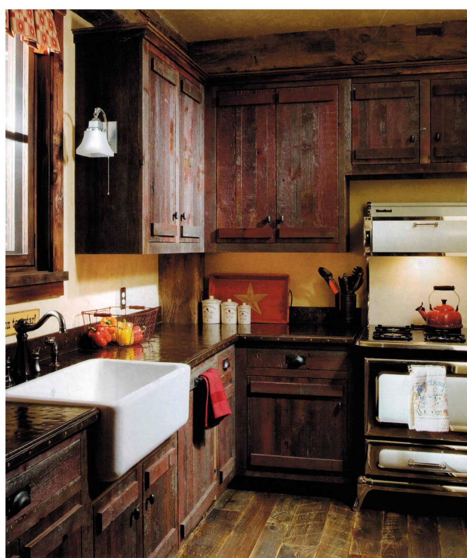
A FARM SINK AND VINTAGE-STYLE STOVE ARE RIGHT AT HOME IN THE COUNTRY KITCHEN. CABINETS ARE BUILT FROM SALVAGED RED BARN WOOD, FOUND AT A RANCH IN CAMAS PRAIRIE. THE RUSTIC COUNTER TOPS ARE ROLLED COLD STEEL THAT HAS BEEN DISTRESSED AND ATTACHED WITH RIVETS. POPS OF TOMATO RED BALANCE THE BROWN ELEMENTS.