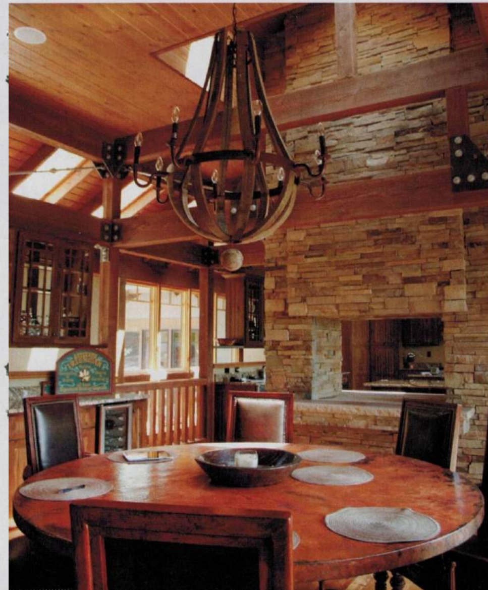
Courtesy Melanie Holden, Holden Design Group; Inset photo courtesy RH, Restoration Hardware, rh.com